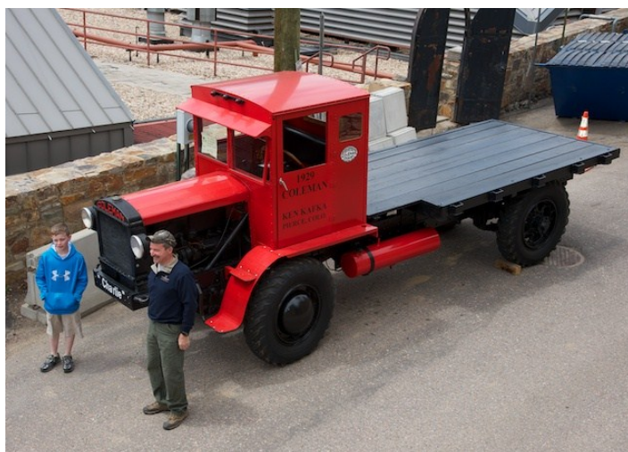
“Charley”, the restored Coleman truck, was also on display during the unveiling of the Central City Submarine.