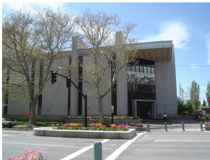
Family History Library in Salt Lake City, Utah

As you can tell from the comments, everyone had a very successful trip to the Family History Library. We have tentatively scheduled the 2012 trip leaving Denver on Monday, April 23rd and returning on Sunday, April 29th. We look forward to another trip next year and hope that you can join us!