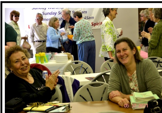
May Luncheon & Book Sale