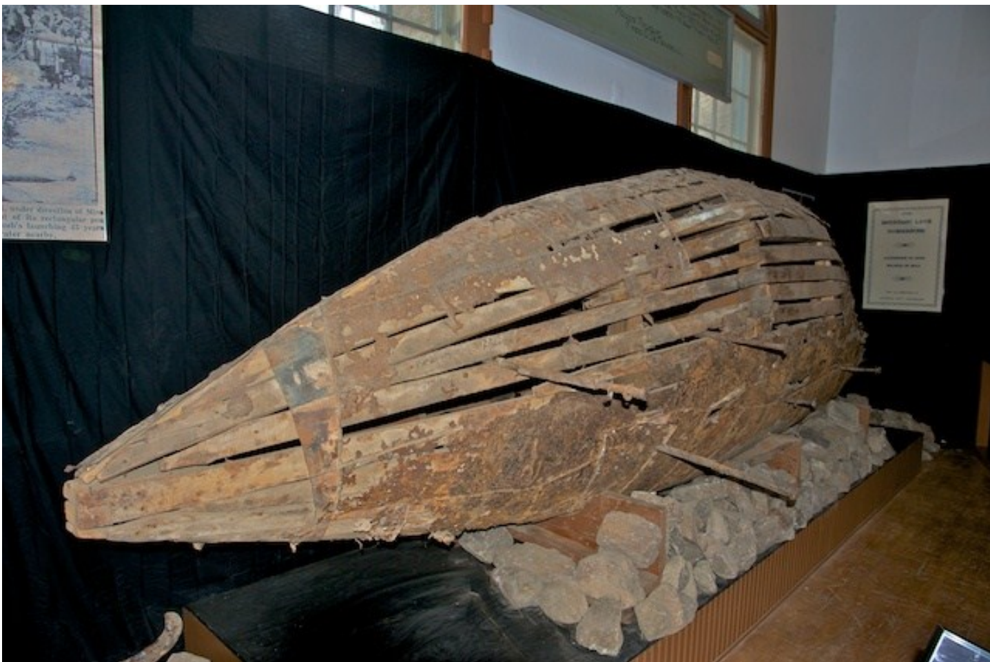
The Central City Submarine on display at the Gilpin County Museum