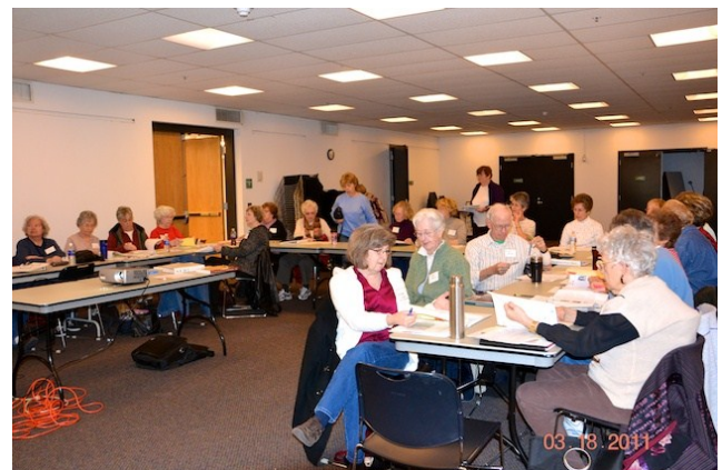
Intermediate Census Research Workshop at Bemis Library on 17-18 March 2011