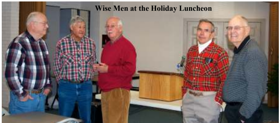
Wise Men at the Holiday Luncheon

2012 brings something new to Columbine. We have new members and new officers. We have new presentations each month to enlighten us about genealogy. We have new places for research this year, like the new building for History Colorado in downtown Denver and the National Archives facility in Broomfield. I already have a new list of genealogical resolutions for this year. How about you?