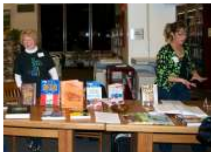
The Genealogy Open House