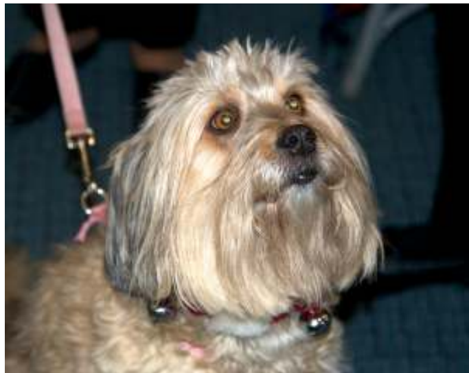
And they say Genealogy is going to the dogs