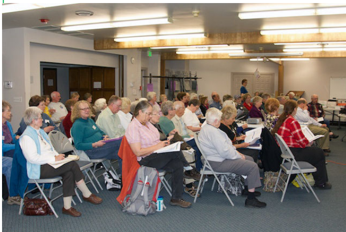
Our members peruse a presenter's handouts at one of our meetings this fall.