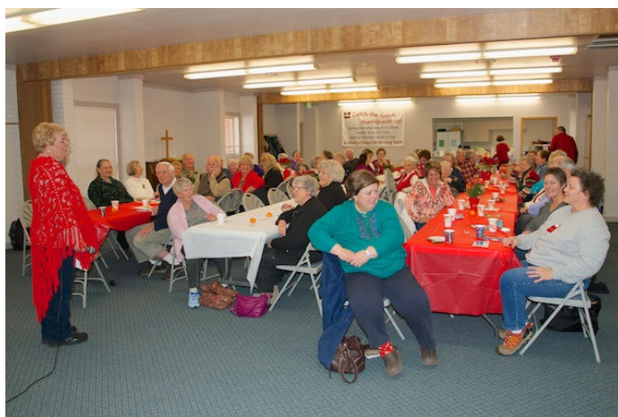
Members awaiting the signal to line-up to eat at the Holiday Luncheon on 10 December.