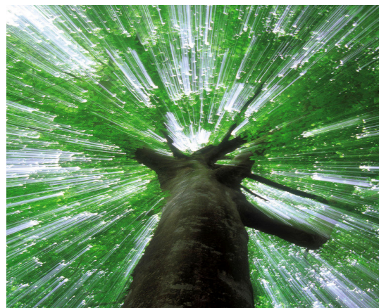
Re-view your Family Tree in 2014!