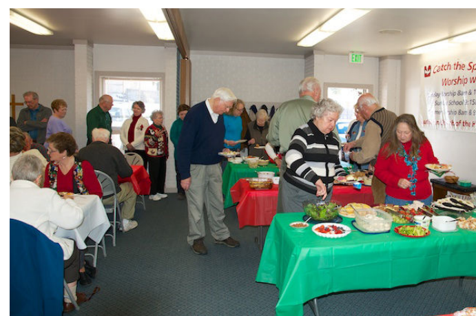
So many decisions to make at the Holiday Potluck on 10 December.!