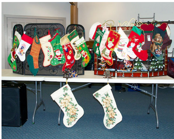
Our "Christmas stockings were hung by the mantle with care" for the Holiday Potluck and Program on 10 December.