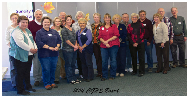
2014 CGHS Board