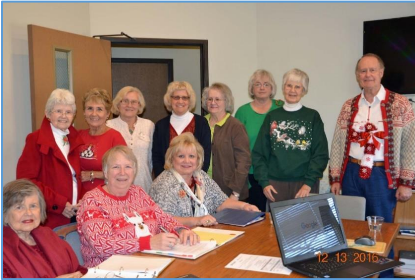
Columbine Writers at the December 2016 Meeting

If anyone is interested in writing a family history, this is a good group in which to learn to create and share your stories. If you feel that your stories or your family is not that interesting, come and listen to the way others put their stories together. Some have incorporated into their stories the census and the area in which their people have lived and died. Others have included just one person in their story. I wrote about the neighbor boy and girl that my brother and I played with while growing up.