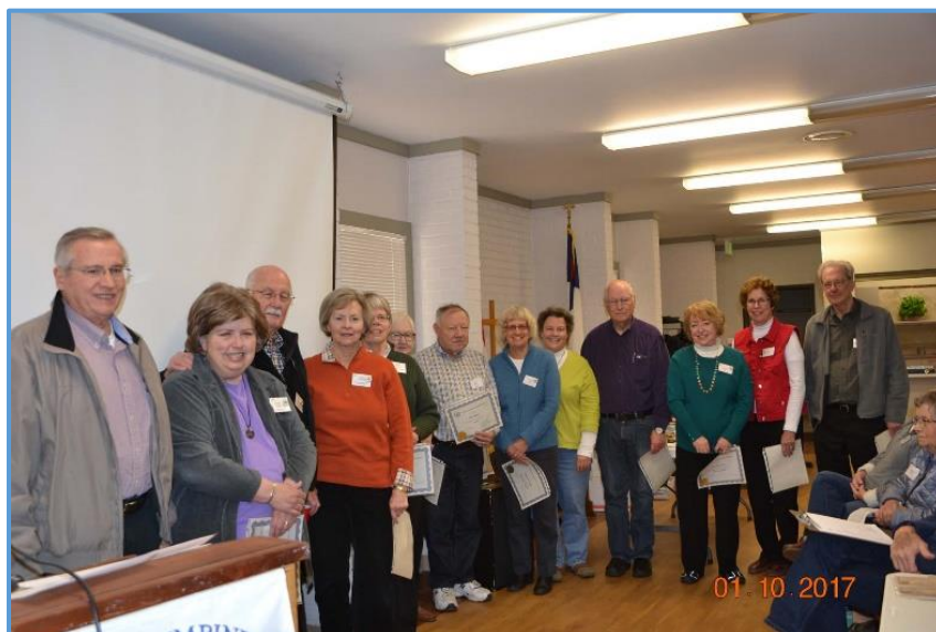
Outgoing Columbine Board of Directors – L to R:

It is far more fascinating to delve into the families of historical characters than to read about them in a history book. It makes a nice respite from hitting one's head against one's own brick wall. It is even more interesting when you can tie your own family to the famous one.