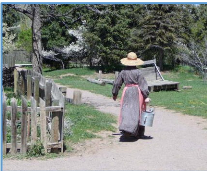
Littleton History Museum