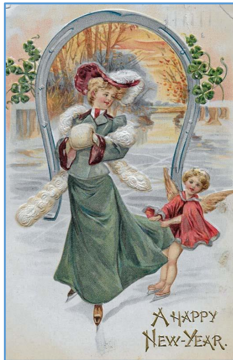
Vintage postcard with 1912 postmark

The New Year is a time for renewal, transition and anticipation at Columbine. While a new board of directors settle into their positions, members anticipate an exciting list of program presentations and early-bird educational opportunities.